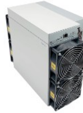
Antminer S19 Pro