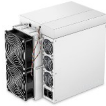
Antminer S19 XP