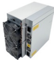
Antminer S19j Pro